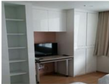
Television & wardrobe